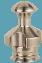
Blank End Plugs (BEP)