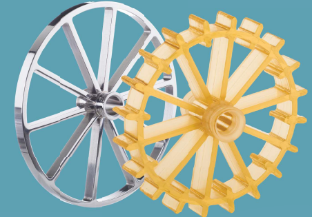
Anti-Telesoping Devices (ATD)